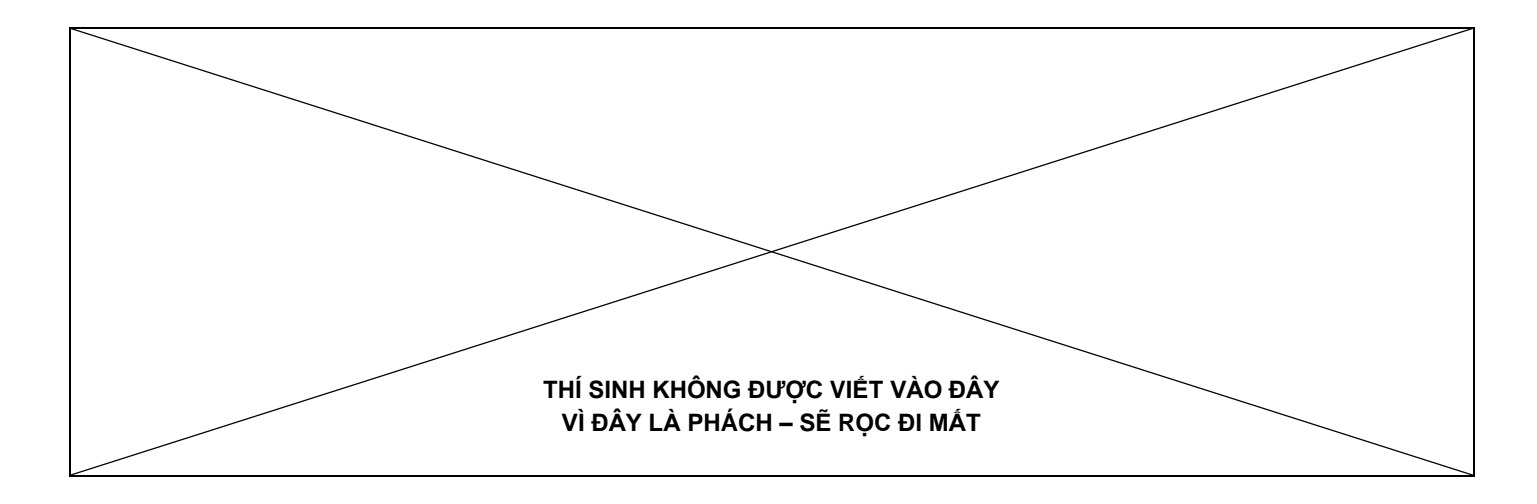
Part 4. For questions 23–28, read the following brochure of an environmental camp and do the tasks that follow.